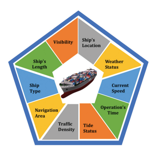
Figure 1: Structure for Dynamic Risk Factors

The risk factors were determined for each group of operations with a detailed literature review and by receiving the opinions of experts in the field through BS. The risk factors may vary according to operation groups. The risk factor that did not affect or that was not suitable for the ship operation was not considered for that group of operations. As a result of HAZID,