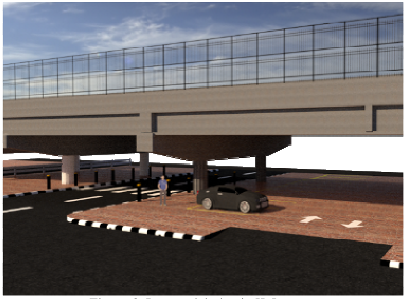
Figure 3. Proposed design in K. Lumpur

Based on questionnaire distributed in Penang, a sports activity is chosen to be developed at BKE Flyover after considerations of the size and location of spaces (Figure 1). In Johor Bahru, a restaurant and café has been chosen to be developed at Lingkaran Dalam Flyover (Jalan Wadi Hana). The location is suitable because it already has parking spaces and not connected to the main road (Figure 2). As for Kuala Lumpur, most of the flyovers are already used as parking spaces. So, we are choosing SBE Flyover (Jalan Pandan Indah 7) to be developed into proper parking spaces that follow rules and regulations (Figure 3).