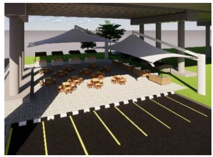
Figure 2. Proposed design in Johor