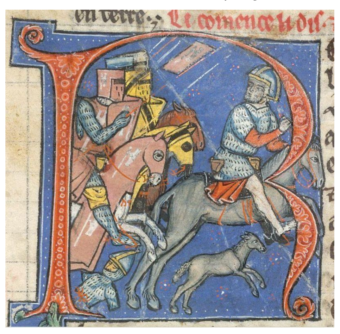
Fig. 1. Sultan Nur ad-Din pursued by crusaders Godfrey Martel and Hugh de Lusignan the Elder (a medieval miniature)