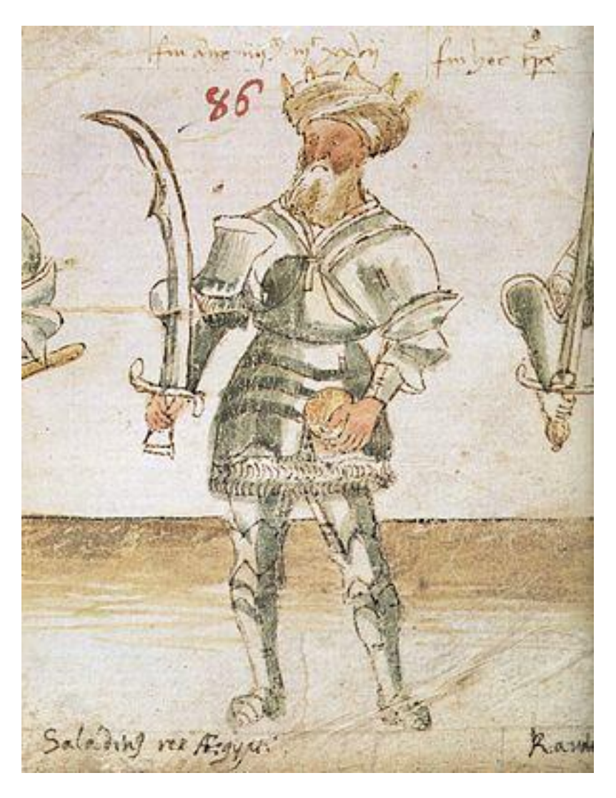
Fig. 2. Sultan Saladin (a medieval European drawing)

It is quite symptomatic that the first part of Baha ad-Din's work, which is a lot smaller than the second one and is a sort of introduction to the account of the deeds of Salah ad-Din, is devoted to discussing his merits as a historical figure. Baha ad-Din emphasizes a significant point right in the first lines of his work – that his hero's "creed was good and he was much mindful of God Almighty" (Baha-ad-Din, 2009: 9). Salah ad-Din's creed was not the result of private spiritual exercise solely. He "took his creed from proof by means of study with the leading men of religious learning and eminent jurisconsults". For example, Shaykh Qutb ad-Din an-Naisaburi* composed for him a sort of manual on the creed of Islam ('aqidah'), which contained "all that was needed in this field". Salah ad-Din always prayed in the company of others, and was devout in his prayers until his last days. He was not greedy for money, land, or real estate. In fact, he died with only forty-seven Nasirite dirhams and a single piece of Tyrian gold in his treasury. The rest of the wealth was expended by Salah ad-Din mainly on charity and gifts for members of his retinue and supplicants (Dyubi, 1994: 134-135)*. The sultan strictly observed the fast. He always tried to