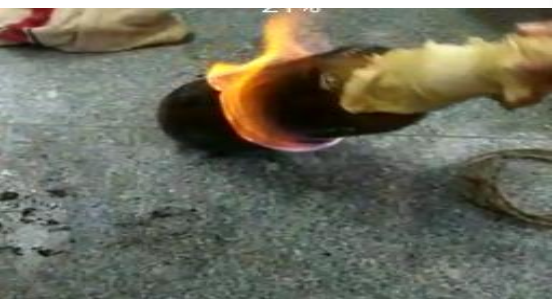
Figure 8 Breking of Kupi and the sublimate deposited at the neck of the bottle was collected and weighed. The residue at the bottom was also collected and weighed as shown in Fig 9.

After self-cooling, the bottle was taken out, scraped broken as shown in Fig 8