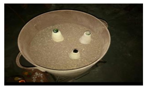
Figure 7 Valuka Yantra

Immediatetrituration was done forming Amalgam. Purified Sulphur, Purified Realgar, Purified Orpiment were added into amalgam and triturated up to complete lusterless powderformed. Kajjali was filtered through cloth. Three hundred grams of Kajjali was filled in the Kupi and was placed in the valukayantra in the center in such a way that Kupi could get equal distribution of heat shown in Fig 7.