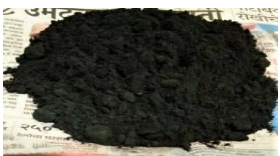
Figure 6 Kajjali

were conducted and preparation of Kajjali was carried out as per classical reference shown in Fig 6.