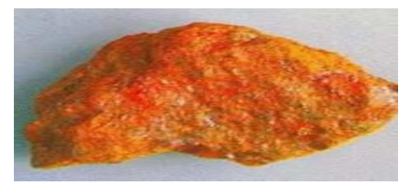
Figure 4 Manahshila