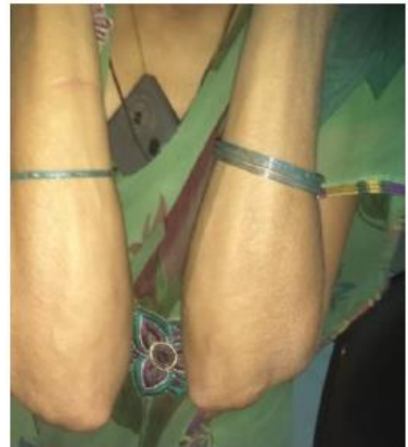
Figure6 showing no plaques on posterior surface of both forearm

becomes of black and reddish colour is known as Ekkustha <sup>7</sup>in Ayurveda . The line