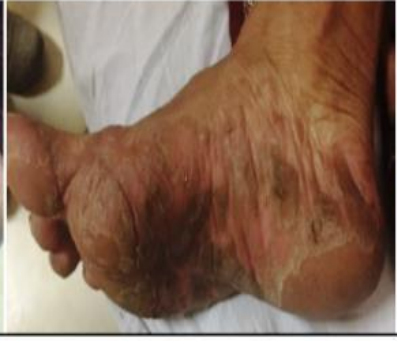
Figure 2 showing black patches on sole of right foot