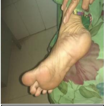
Figure 7 showing no black patches on sole of right foot