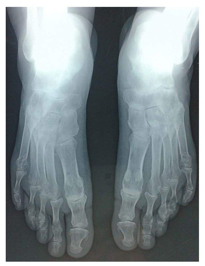
\textbf{Figure 3.} \ Radiographs \ of \ the \ foot \ showed \ erosion \ of \ the \ fifth \ head \ metatars ophalangeal \ joint \ in \ bilateral