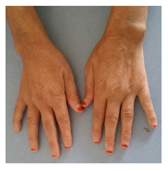
Figure 1. Deforming chronic polyarthritis with a touch of piano, a boutonniere of the fifth finger bilaterally with thumb adductus

duodenal biopsy: histological aspect in favor of a type 3c CD according to the Marsh classification. The patient returned to remission after a gluten-free diet. Then she was admitted to the rheumatology department for management of inflammatory symmetric and deforming polyarthritis of the hands (Figure 1) and the feet, evolving for 22 years. Laboratory workup revealed GB = 10120/\text{mm}^3 , Hb = 10.3 g/dl; Platelets = 356000/mm<sup>3</sup>; C-reactive protein = 31 mg/L; ESR = 36 mm/H; Rheumatoid factor was positive. Radiographs of hands and wrists showed destruction of the carp, erosion and pinching of metacarpophalangeal joints and proximal interphalangeal (Figure 2). Radiographs of the foot showed erosion of the fifth head metatarsophalangeal joint in bilateral (Figure 3). According to the patient's clinical profile and radio-biological results, she was diagnosed to be suffering from RA. A treatment based on prednisone 10 mg/day with methotrexate 15 mg/week was started, with a clear improvement, regression of inflammatory syndrome and improvement of quality of life.