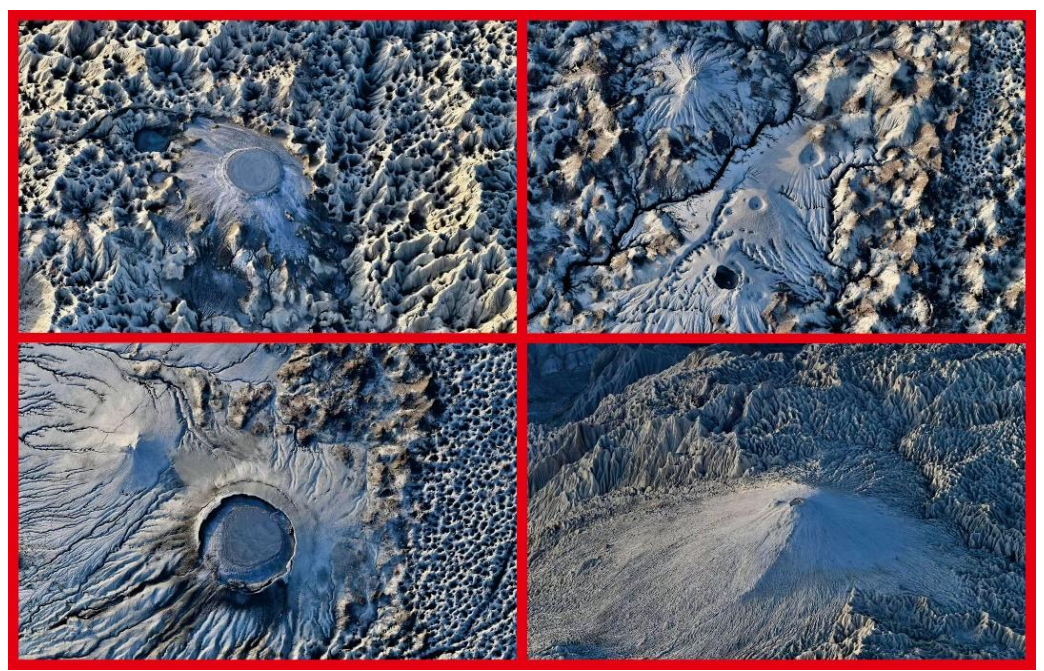
Figure 3: Signifies chandragup mud volcanoes and surrounding mudflows