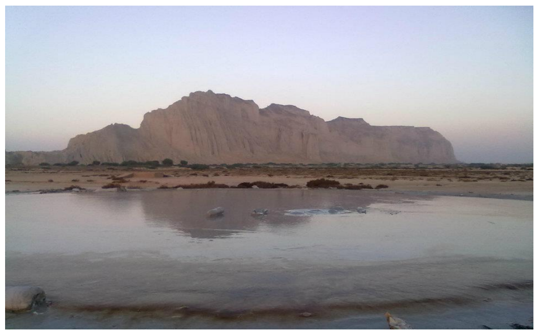
Figure 2: Illustrates a close-up view of Gwadar mud volcano.

It is located nearby Gwadar city (Delisle et al., 2002) (Fig. 2). The area sheltered by the focal mud volcano is approximately 0.11 ha and crater diameter ranges from 1 to 7 m. A total of two mud volcanoes have been recognized which exemplifies no activities (Kassi et al., 2013).