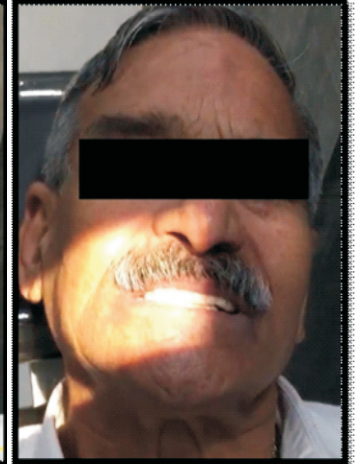
Figure.1 a,b Profile - Patient

causing difficult in speech at rest and function both. (Figure. 1a,b) According to the history given, his problem started 6 months ago when implants were restored in upper arch.