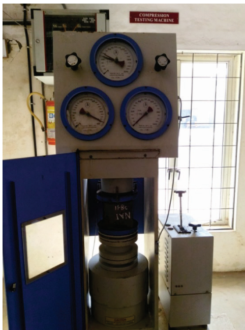
Figure 4 – Experimental setup for compressive strength of concrete

For compressive strength, the specimens are tested on 150 x 150 x 150 mm cubes as per IS 516 -2004 [12]. During testing, the load is applied at the rate of approximately 140 kg/ sq.cm/min, as shown in figure 4. Flexural strength is tested on prism 100 x 100 x 500 mm by three-point loading method as per IS 516– 2004 [12]. The experimental setup is as shown in figure 5. The load is applied at the rate of 180 kg/ min. Split tension test is conducted on cylinder specimen 150 mm diameter and 300 mm length, the surface of the specimen is wiped out for any impurities. The load is applied continuously at the rate of 16 kg/cm 2 /minute and the breaking load is noted.