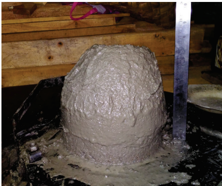
Figure 1 – Experimental Setup of Slump test