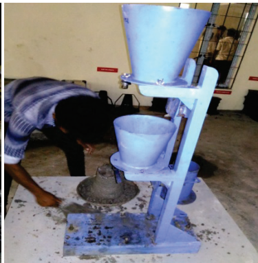
Figure 2 – Experimental Setup of Compaction Factor Test