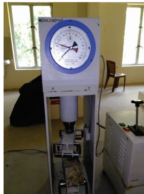
Figure 5 – Experimental setup for flexural strength of concrete by three point loading