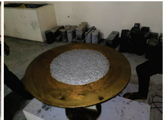
Figure 3 – Experimental Setup of Flow Test