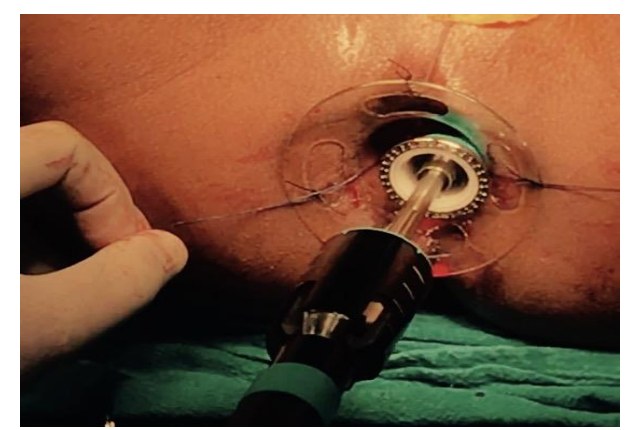
Fig. 4: Introduction of Stapler head beyond the purse string

The stapler gun was inserted through the circular Anoscope, with the head of the stapler maximally opened. The head was then passed through the purse-string suture. The purse-string suture was tied on the stapler shaft (Fig. 4).