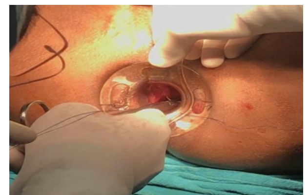
Fig. 3: Purse-string submucosal sutures

A purse-string suture with 2-0 Prolene was taken approximately 4 cm above the dentate line. Only the mucosa and Submucosa was taken during Sutruing. Once pursestring was completed circumferentially, the suture Anoscope was removed from the circular Anoscope (Fig. 3).