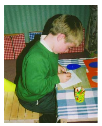
Figure 5. The Insets for Design to Support Reading & Writing Development (Fidler, 2004, p. 32)

The next materials are the tracing apparatus known as the insets for design. The learners can be trained to avoid left and right confusion and develop the neurological pathways for reading and writing (p. 34).