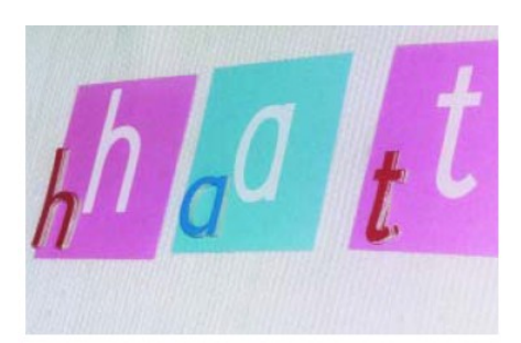
Figure 4. Learning the Lower Case (Source: Fidler, 2004, p. 34)

(Fidler, 2004, p.33). The learners can be asked to do the following activities, namely tracing and sounding out letter shapes on sandpaper letters; in rice, flour or jelly, with paint and in the air during dance; identifying the initial sounds of everyday objects; playing 'eye spy', using only a small tray of phonically correct objects to maintain control of error; identifying letters within the environment, for example on alphabet friezes, in books and on name labels (2004, p. 33).