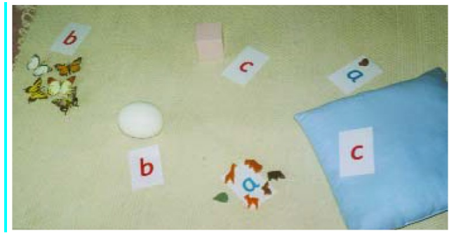
Figure 6. Aids to Identify The Initial Sounds of Everyday Objects (Fidler, 2004, p. 34)

Another important aspect in supporting reading ability for learners with dyslexia is the choice of reading topic and contents. The topic should be of the learners' interests so that they will be encouraged to read. In addition, the contents of the reading are essential too. Complicated spellings and the appearance of idioms might not be a good choice for the learners with dyslexia. (p. 35)