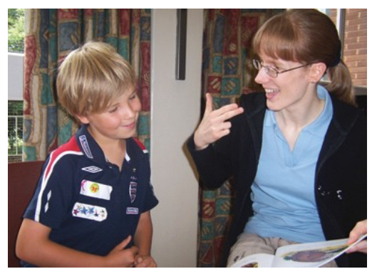
Figure 2. Teacher Cueing a Story (Fidler, 2010)

Fidler mentioned that "Lip-reading involves a lot of guess-work and is very tiring" (2010). Whereas, using cued speech, learners can comprehend "the whole of the spoken language" without guessing. So, how does the cued speech work? It clarifies the lip patterns of normal speech by using eight hand shapes and four positions together with the lip patterns of normal speech. It allows parents and teachers to use their own language in a visual form and in its entirety, thus giving hearing impaired children full to the language.