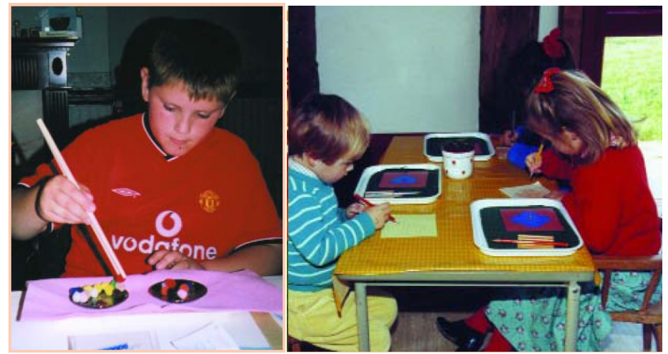
Figure 7. Left, Fine Motor Skills Development; Right, Hand & Eye Control with Pencil Work (Fidler, 2003)

All Montessori materials are designed in multiple physical concepts and multisensory support, the weaker areas are compensated for (Fidler, 2008, p. 38). In addition, they can be done from the elementary to high school and can be used repeatedly. Elementary and high school materials build on the earlier Montessori materials foundation. Learners in higher grades move gracefully into abstract thinking, which transforms their learning. The Montessori materials support responsible interactive learning and discovery (American Montessori Society, 2016).