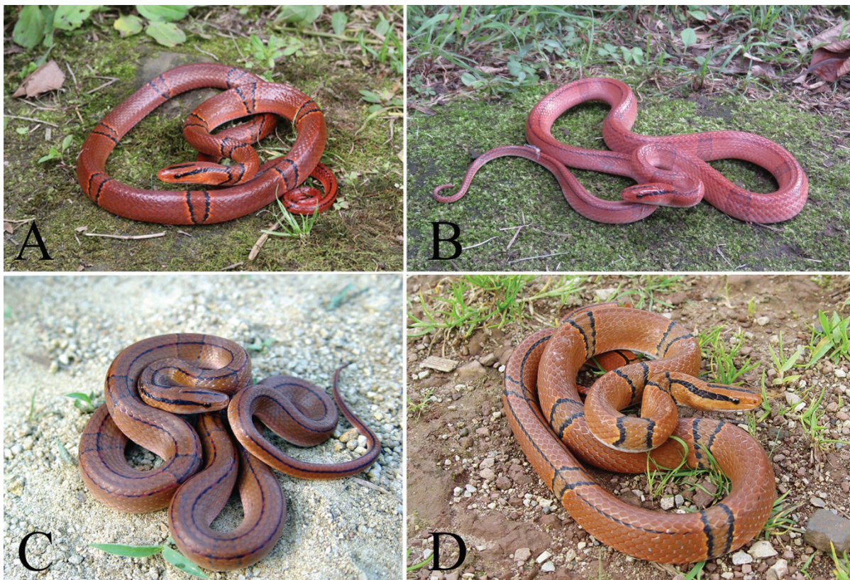
Figure 1 General view of Oreocryptophis porphyraceus from Yunnan (A: O. p. pulchra ), Zhejiang (B: O. p. vaillanti ), Hainan (C: O. p. hainana ), and Sichuan (D: central China population)

Chengdu Institute of Biology (CIB), Chinese Academy of Sciences (CAS). Specimens were scanned at 70 KV with a flux of 114 \mu A, with other parameters set following Shi et al. (2017). A total of 720 transmission images were reconstructed into a 2 048×2 048 matrix of 802 slices using VGStudio max (a three-dimensional reconstruction program) developed by CIB, CAS. Based on the photos, 20 characters were recorded or measured by direct counting, Snake Measure Tool software, or digital slide-caliper. Measurements and descriptive methods for different bones and characters followed Cundall (1981) and Guo et al. (2010) and their abbreviations are listed in Appendix II.