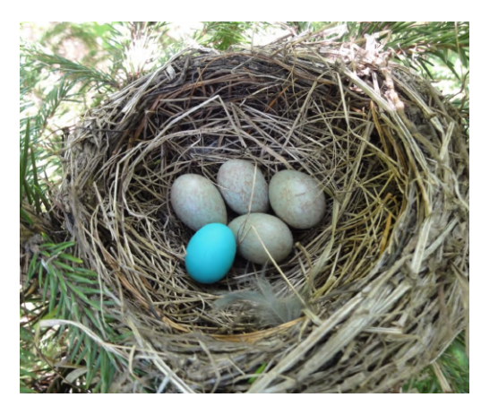
Figure 2 Experimental nest of the grey-backed thrush with a blue model egg

potential nest sites and monitoring the activity of reproductive adults. Nests were then randomly sorted into two groups: (1) manipulated group into which one immaculate blue model egg was introduced just after clutch completion (n=12) (Figure 2); and (2) control group in which nests were visited by the same procedure to control for human disturbance, but no manipulation was made (n=10). Manipulation was performed in these circumstances without observing hosts to avoid potential effects of host observations on recognition (Hanley et al., 2015). Observed nests were monitored for 6 d after manipulation and the responses of thrushes to foreign eggs were classified as rejection, if foreign eggs were ejected, pecked, or deserted, or accepted if foreign eggs were intact and incubated (Yang et al., 2010, 2014b). Model eggs were made by polymer clay and their sizes were standardized to 25 mm×19.5 mm, similar to thrush eggs (25.07±0.42 mm×19.74±0.71 mm, n=10).