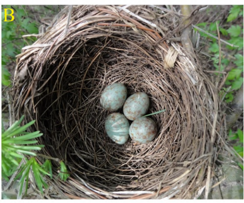
Figure 1 Nest site, nest, incubating female, and eggs of the grey-backed thrush

All experiments complied with the current laws of China. Experimental procedures were in accordance with the Animal Research Ethics Committee of Hainan Provincial Education Centre for Ecology and Environment, Hainan Normal University (permit No. HNECEE-2012-004).