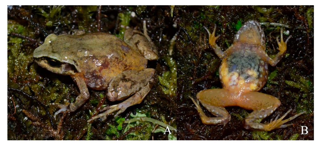
Figure 6 Gravid female (A) and developing eggs through transparent abdomen (B) of Liurana xizangensis from 62K, Medog County, Tibet, China.