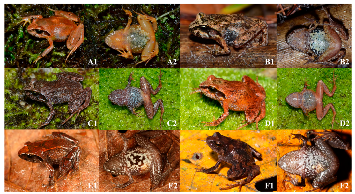
Figure 4 Comparisons of dorsal (1) and ventral (2) views of live individuals of Liurana xizangensis (A and B), L. alpina (C and D), L. medogensis (E), and Liurana vallecula sp. nov. (F).