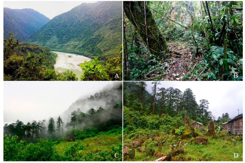
Figure 5 Habitat of Liurana vallecula sp. nov. (A) (Xirang, elevation 550 m a.s.l.), L. medogensis (B) (Xigong Lake, elevation 1 300 m a.s.l.), L. alpina (C) (Dayandong, elevation 3 000 m a.s.l.), and L. xizangensis (D) (62K, elevation 2 800 m a.s.l.) in Medog County, southeastern Tibet, China, respectively.