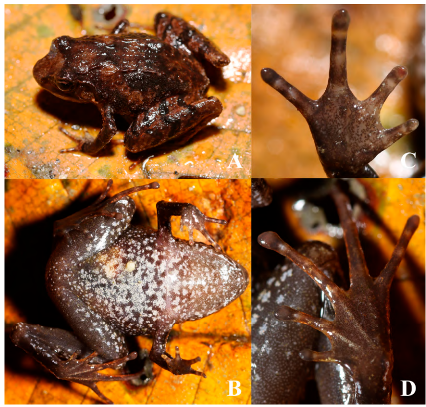
Figure 3 Holotype of Liurana vallecula sp. nov. in life (adult female, KIZ014083) A: Dorsolateral view; B: Ventral view; C: Ventral close-up of hand; D: Ventral close-up of feet.

Maximum likelihood bootstrap and Bayesian posterior probability values are given at all nodes (in such order respectively), except the internal nodes within L. xizangensis from Locality #2, which have short branch lengths and resemble polytomy.