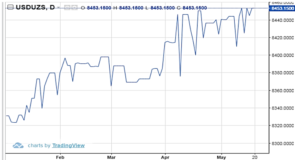
Figure 2. Spot exchange rate of Uzbekistan

10. The financial and banking system of the Republic will be aimed at continuation of the ongoing measures to perfect the accounting and financial reporting system in accordance with the International Financial Reporting Standards (IFRS).