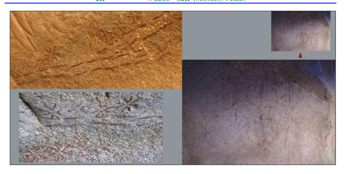
Figure 2. Picture with two underlined circles (wheeled) and a straight line between them.

As mentioned above, there are also black-and-white images in the pictures, which can be drawn not by natural color, but by means of coal or some wooden remains. There are also many unclear and distorted images in these pictures.