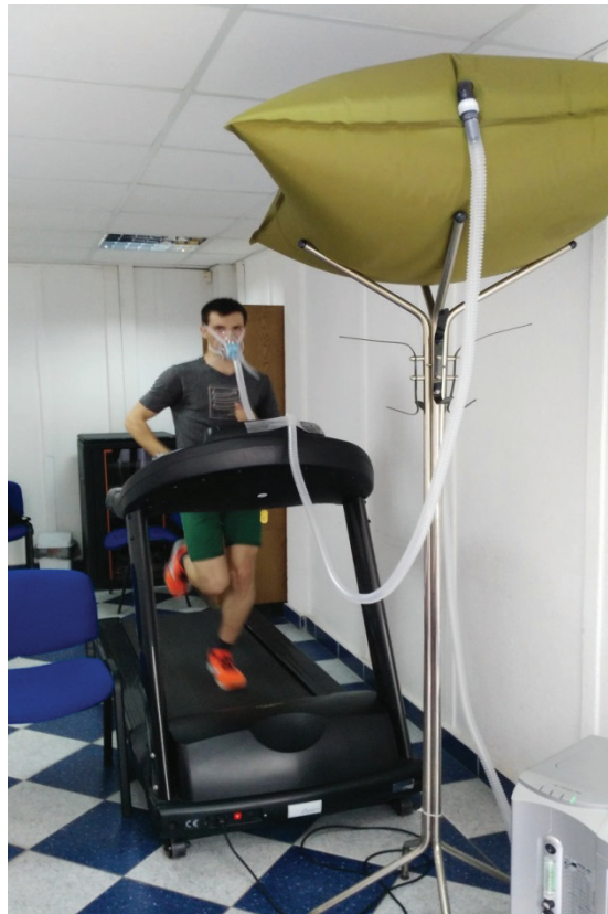
Figure 1. Hypoxic training with hypoxicator

with duration of five minutes each and rest periods in-between until heart rate falls to 120 per minute. Each person breathes through a mask connected to the hypoxicator (Fig. 1).