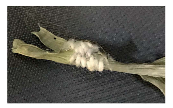
Fig. 3. Cotesia ruficrus cocoons collected from Spodoptera frugiperda larva in maize field (Karnataka).

the yellowish brown cocoons of A. narangae mentioned in Wilkinson (1928). However Wilkinson (1928) did mention that cocoons of A. sydneyensis were white in colour and cocoons of the Indian specimens were not observed.