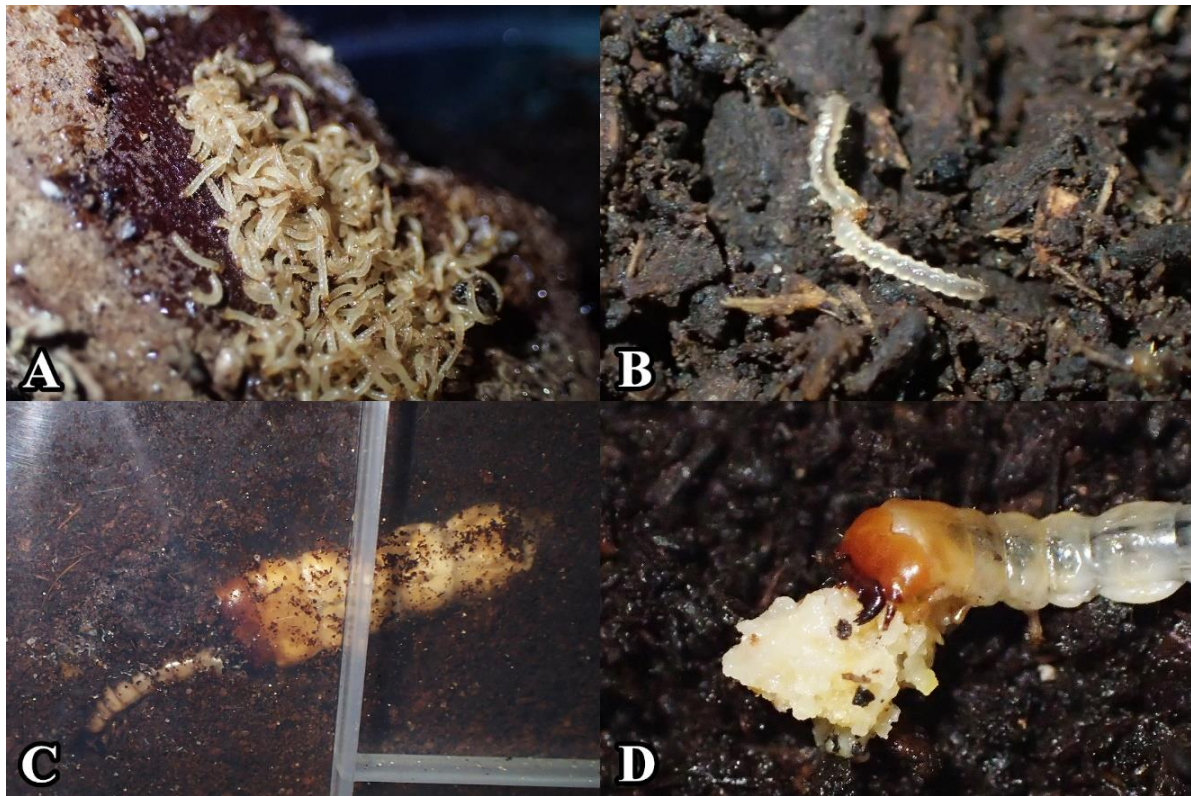
Figure 2. Larvae of Trictenotoma formosana Kriesche, 1919. A - first-instar larval group; B - larvae of T. formosana feeding on conspecific; C - larva of T. formosana feeding on a larva of Zophobas morio ; D - larva of T. formosana feeding on wet fish food.