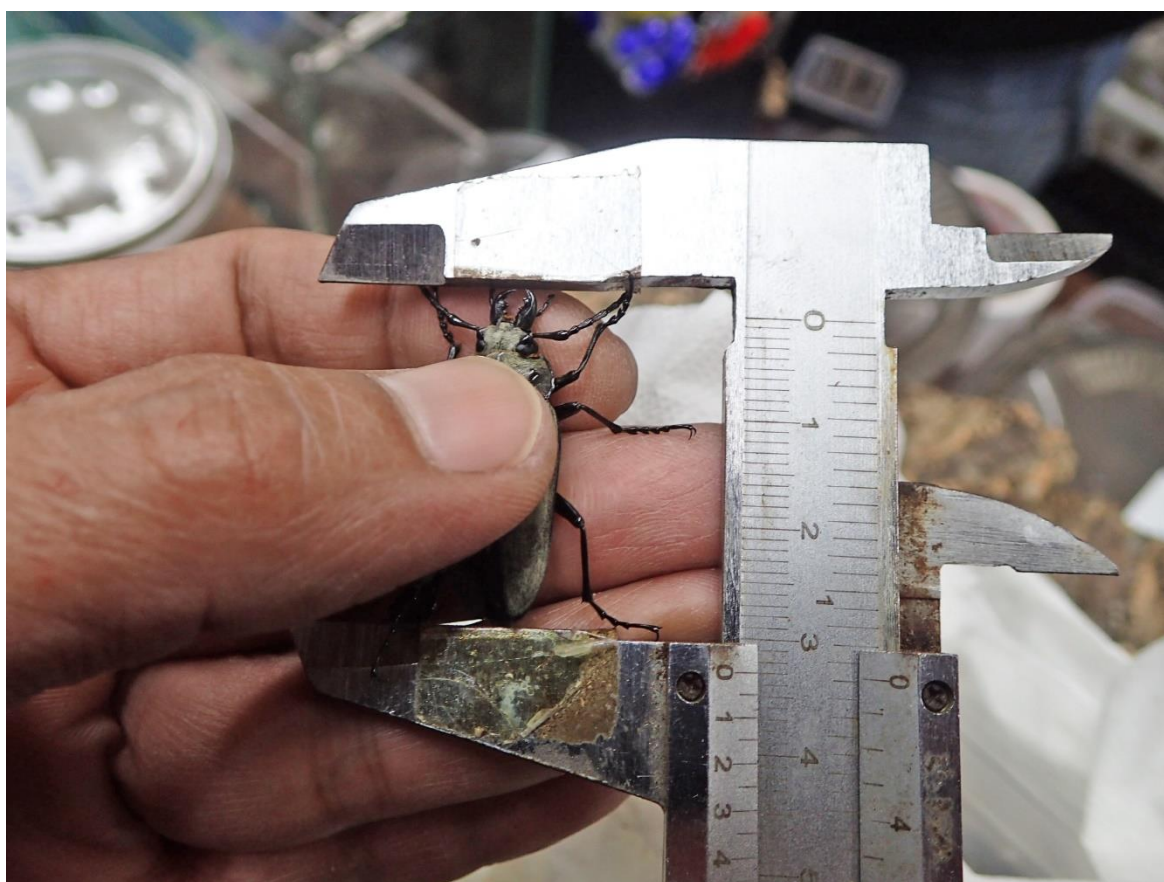
Figure 7. The smallest adult male among reared specimens from our studies.

The taxonomic history of Trictenotomidae is complex. Westwood (1848) placed Trictenotomidae near the Cerambycidae in Chrysomeloidea; this concept has also been supported in recent works in which the classification is based only on characteristics of the adult (Ferrer & Droumont, 2003; Droumont, 2006). Trictenotomidae was also treated as a subfamily of Pythidae by Crowson (1981) but no reasons were given for this placement. Watt (1987) proposed that Trictenotomidae, Boridae, and Pythidae should be separate families, and, in the same work, produced a cladogram based on characteristics of larvae and adults: (Trictenotomidae + (Salpingidae + (Boridae + Pythidae))). A similar cladogram, also based on morphological features of larvae and adults, was published by Pollock (1994) who hypothesized the following relationships among the same families (with the inclusion of Pyrochroidae): (Trictenotomidae + (Salpingidae + (Boridae + Pythinae + Pilipalpiniae + Pyrochroidae))). In a recent paper (Beutel & Friedrich, 2005), a phylogenetic tree of Tenebrionoidea was established based on characteristics of larvae, which supported Trictenotomidae as a sister group of Pythidae. However, this work was based only on the old voucher specimen of Trictenotoma childreni described by Gahan (1908) which was old and in poor condition. Kergoat et al. (2014) established a phylogenetic tree