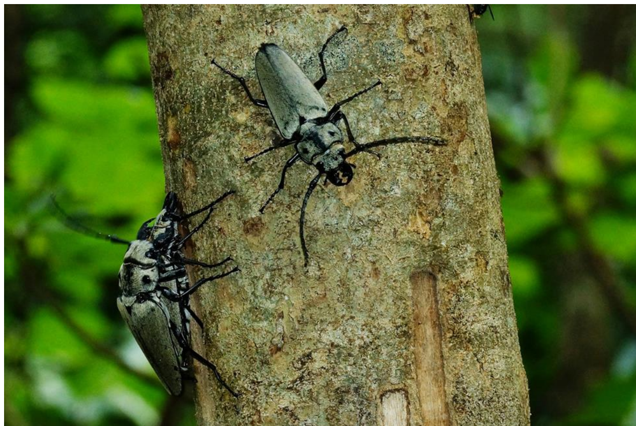
Figure 5. Adults of Trictenotoma formosana Kriesche, 1919 on a tree trunk, feeding on sap and mating (Photo by Liu, M.-H.).