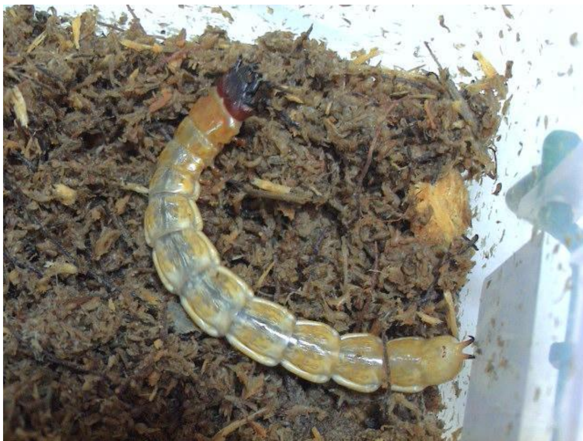
Figure 6. Trictenotoma larva collected by a local observer.