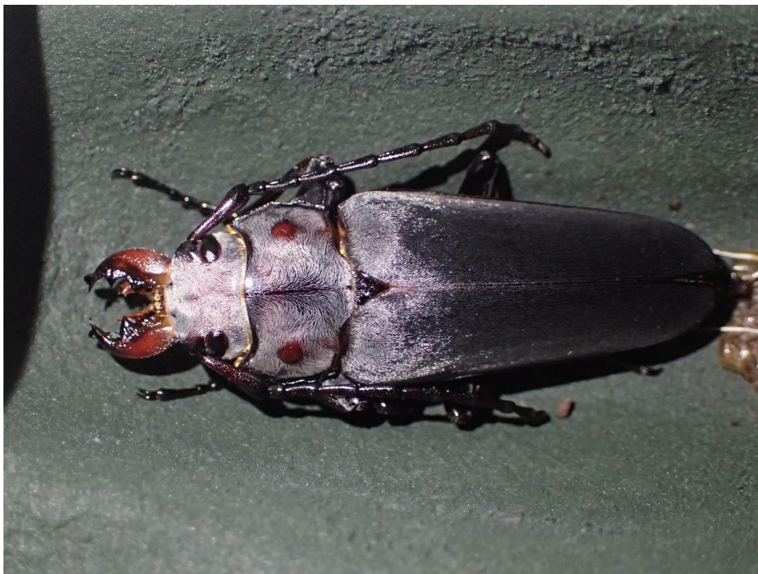
Figure 4. Newly eclosed adult male of Trictenotoma formosana Kriesche, 1919.