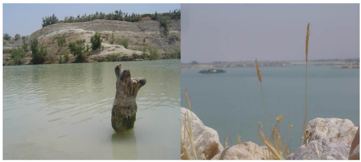
Figure 2: AL-Karama Dam overview

The dam catchment area is relatively flat, possessing high porosity and permeability allowing rapid infiltration of rainwater resulting a very limited collected quantity of surface runoff, which has been estimated to an average 1 MCM annually. (Gibb, 1993). Also, farmers in the Jordan Valley have been deprived of fresh irrigation to be diverted to the dam to test it and to allow operational maintenance. However, this water became saline in the dam reservoir and that was discharged unused to the Jordan River (Salameha, 2004).