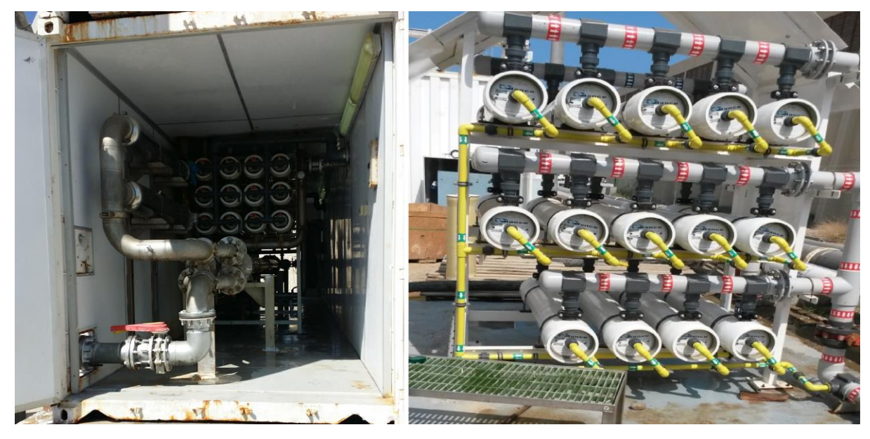
Figure 3: RO desalination plant in a mobile system

From the all-aforementioned information about desalination plant, capital and unit cost will be useful in the current study and future plan for similar cases such as dams and brackish water as small-scale plants. Such information are considered as benchmark in which we can combined them with solar desalination system in order to improve the production capacity of the treated water to be greenery and sustainable as possible. Also, from both capital and unit cost results we can improve the cost of our plan when using solar desalination in the area and unit cost will be expected little lower than the usual desalination. In this study, we are trying to have solar desalination together with mobile desalination system that is functioning with RO membrane as seen in Figure 3. RO desalination mobile system is a full package with different capacity that can start from 500 to 5,000 m³/day, which will be enough for the start of the treatment.