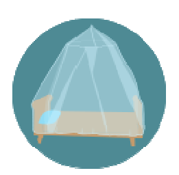
Figure 7: Mosquito Nets