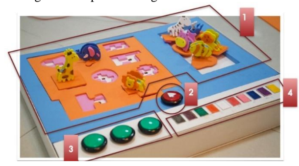
Figure 3. Controller of the game system

colour section. All buttons have extended their functions from the Makey Makey. The proposed controller is identical; to make sure that a player can play the game. The tutorial on how to use the controller to play the game is also provided at the beginning of the game. The developed controller of the game is depicted as Figure 3.