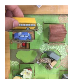
Figure 5. Demonstration of using physical interface in game 1

The design of the game also takes into account the updateability of a new set of vocabulary. The surface of the board is designed to be replaceable. When children have already leant the vocabulary of particular domain, the new sets of vocabulary in other domains can be used as replacement as shown in Figure 6.