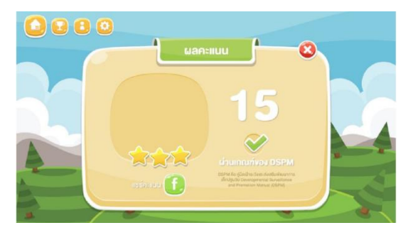
Figure 7. The scoring interface

The game also has administration menu for flexibility to expand and adjust the content of the game. The software is designed to allow new vocabulary and can be updated to associate with the new tangible items (i.e. in game 1). New pronunciations can also be re-recorded together with new graphics to be added as well.