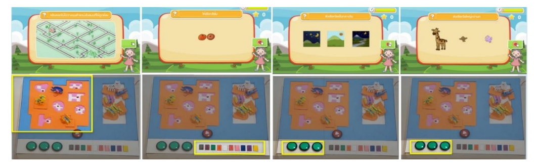
Figure 4. Game interfaces

The game system contains four mini-games designed to associate with the developed controller. In general, the story of the game is progressed through a girl intentionally designed to have a similar age to players. The girl will challenge a player to perform certain tasks indicated in DSPM using the voice instructions. During the play, when a player answers a question/performs the correct action; applause is given as a small reward to a player. Otherwise, an encouraging sound will respond back to encourage a player to try again. When players can achieve the mission of that mini-game, the game will lead the player to the new game. The interfaces of the four mini-games which are associated with the proposed controller are illustrated in Figure 4.