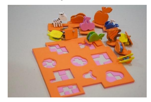
Figure 6. The new set of vocabulary

The design of the game also takes into account the updateability of a new set of vocabulary. The surface of the board is designed to be replaceable. When children have already leant the vocabulary of particular domain, the new sets of vocabulary in other domains can be used as replacement as shown in Figure 6.