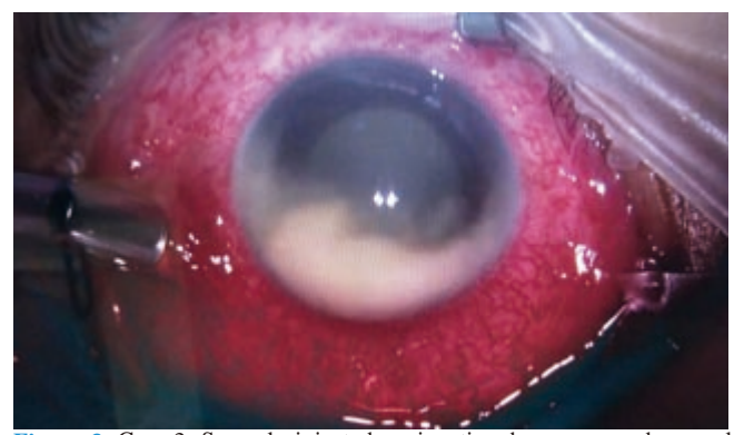
Figure 3. Case 2: Severely injected conjunctiva, hypopyon and corneal oedema.

injection. There was pus collection in the vitreous cavity. However, the vitreous biopsy showed negative result but melioidosis serology from blood sampling was positive (1:640). He did respond to the treatment initially but 3 weeks later he developed superior and inferior retinal detachment. The right visual acuity remained poor (HM) after vitrectomy with silicone oil tamponade and completion of intravenous ceftazidime 25 mg/kg TDS for 2 weeks and oral amoxicillin/clavulanic acid 20 mg/kg BD for 4 months.