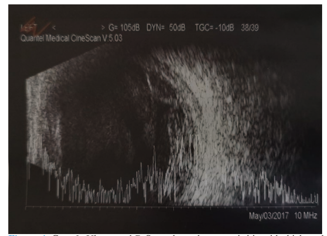
Figure 4. Case 2: Ultrasound B-Scan showed severe vitritis with thickened sclera on presentation.