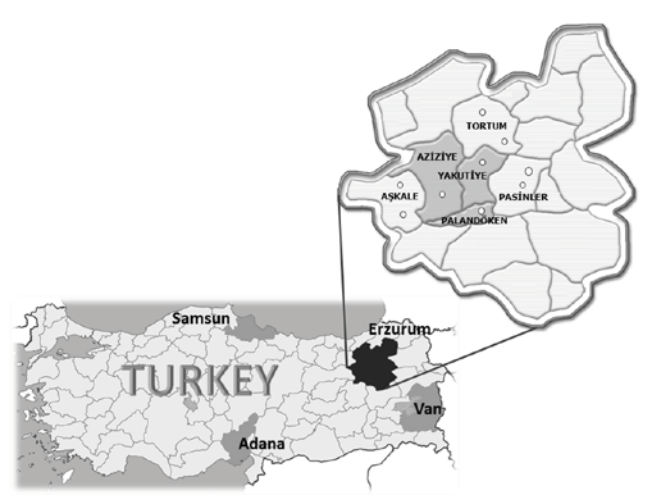
Figure 1. Locations of samples collected from the Province of Erzurum, and surroundings in Turkey.

Stool samples were obtained between 2016 and 2017 from small family farms in eight different centers, namely Erzurum center and Yakutiye, Palandöken, Aziziye, Aşkale, Tortum, Pasinler, and Hasankale (Figure 1). According to the rapid test kit results, stool samples that have none of the common enteric pathogens (rotavirus, coronavirus, Escherichia coli, Clostridium and Cryptosporidium ) were included in the study. Stool samples from a total of 72 calves with diarrhea were used in the study.