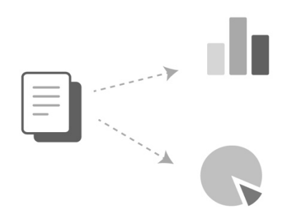
Figure 1. Deciding how to explain

that visualize a stack of information or infographic information. The infographic standard conveys a more creative language rather than a plain writing style. In these days, infographics are often confronted in the media, in printed work, on road signs and in manuals.