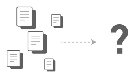
Figure 2. Combining data

Information visualization is a more effective method for transferring information to people rather than the audio or written media. Animation of these static visuals with animation techniques increases the effect of information transfer.