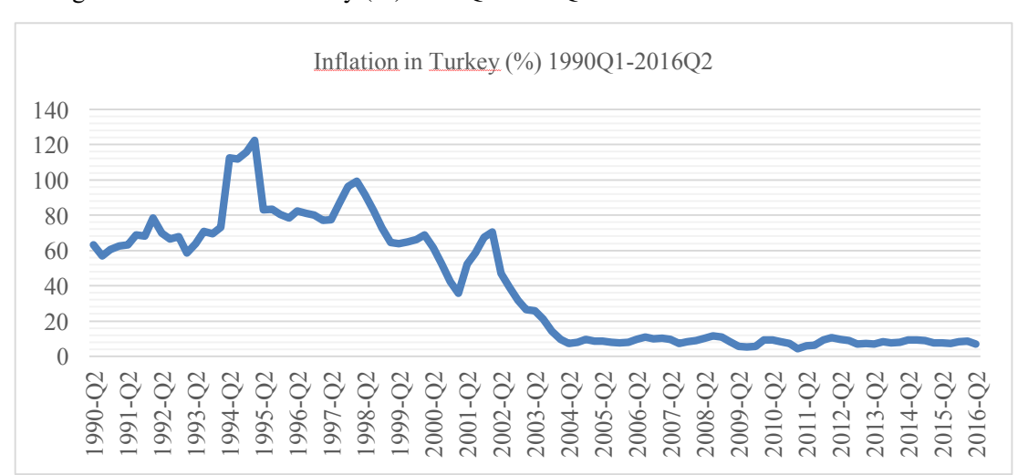
Figure 1. Inflation in Turkey (%) 1990Q1-2016Q2

Us concludes his analysis by stating: "The continued success of the fight against inflation is mostly dependent on the structural programs, most of which are still to come. (....) The implementation of the structural reforms will raise credibility as the reforms are performed successfully [emphasis added]".