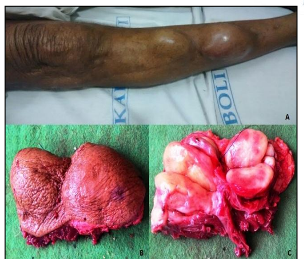
Figure 1A & 1B - Skin covered mass measuring 18x 9 9x2cm in size, along with scar seen on lateral aspect of right leg. Figure 1C - Cut section of the mass shows Yellowish tan coloured homogenous mass with no areas of necrosis and hemorrhage.

The patient underwent wide local excision of the mass and the specimen was sent for histopathological examination. On gross examination, mass was skin covered cm with 17x 8.5x1 measuring two circumscribed, firm nodules. largest measuring 7x7x5 and smallest cm measuring 5x4x3.5 cm. On cut section the mass was yellowish tan coloured with no areas of hemorrhage or necrosis seen. (Figure 1-A, B, C). Hematoxylin and Eosin stained sections studied showed tumor cells arranged in fascicles, vague storiform pattern at the periphery showing marked myxoid degeneration along with both neoplastic proliferation of fibroblasts and histiocytes. The histiocytes being round to oval with vesicular nucleus and indistinct cvtoplasm. Mild degree nuclear of pleomorphism and occasional mitosis was seen along with increased blood vessel proliferation.( Figure 2A & 2B ). Immunohistochemically the tumor cells were positive for CD 34, focally positive for SMA, Ki-67 showed 40% proliferative index and were negative for S-100, Pan Ck and Desmin thus confirming the diagnosis of DFSP with myxoid variant.(Figure 3-A,B,C,D & E)