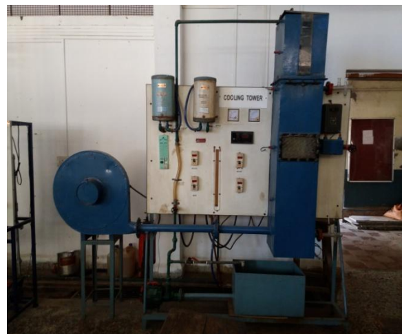
Fig.1: Cooling tower

Experimental studies were carried out on cooling tower in chemical engineering department of DattaMeghe College of Engineering, Airoli.