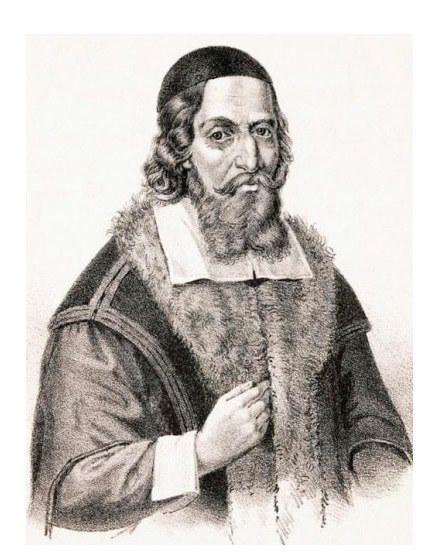
Fig. 2. Jan Amos Komensky (1592–1670)

Of importance is the fact that, after watching the Protestants, the Catholic Church would also join the process of creating schools. For a long time, issues related to public education were handled by the Jesuit Order solely (Demkov, 1912). Although the Jesuits were mainly focused on education for the higher strata of society, in countries where the population was in part Protestant, next to Jesuit schools were Protestant public and German schools. They would open up their schools and provide catechesis to the common people as well. Subsequent to the end of the Thirty Years' War, regions where Catholicism was entrenched would eventually witness public schools for the common people going into decline. Subsequent to the end of the Thirty Years' War, regions where Catholicism was entrenched would eventually witness public schools for the common people going into decline. Restoring the public education system in Catholic Germany was now up to Silesian prelate, Johann Ignaz von Felbiger (Fig. 3), who in 1758 was appointed abbot of the monastery of Sagan in Lower Silesia (Rekhnevskii, 1860b: 119).