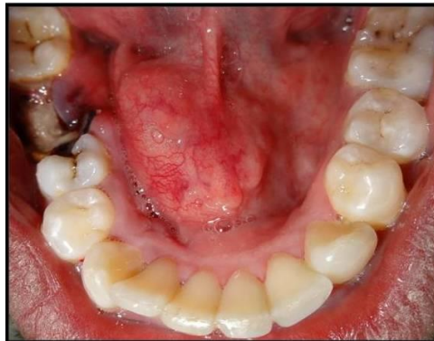
Fig. 1: Clinical Presentation of a Swelling