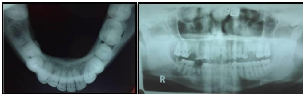
Fig. 2: Occlusal and panoramic images