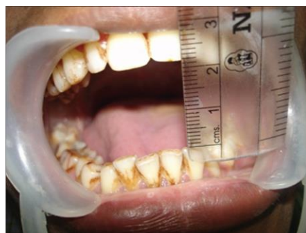
Fig. 1: Restricted mouth opening with inter-incisal distance 21 mm

There was involvement of all the facet joints of spine resulting in thoracolumbar kyphosis. He was unable to look up and the symptoms gradually worsened. He had no history of trauma or any pathology of the TMJ. The patient also reported a habit of chewing dried areca nut powder 5-6 times per day for the past 3 years. He occasionally mixed calcium oxide with areca nut powder. Examination revealed that mouth opening was limited to about 21 mm (Fig. 1). His oral cavity was fully blanched and thick fibrotic bands were palpable bilaterally on the buccal mucosa. There was also marked neck flexion and forward thrusting of head (Fig. 2). Condylar movement was also restricted.