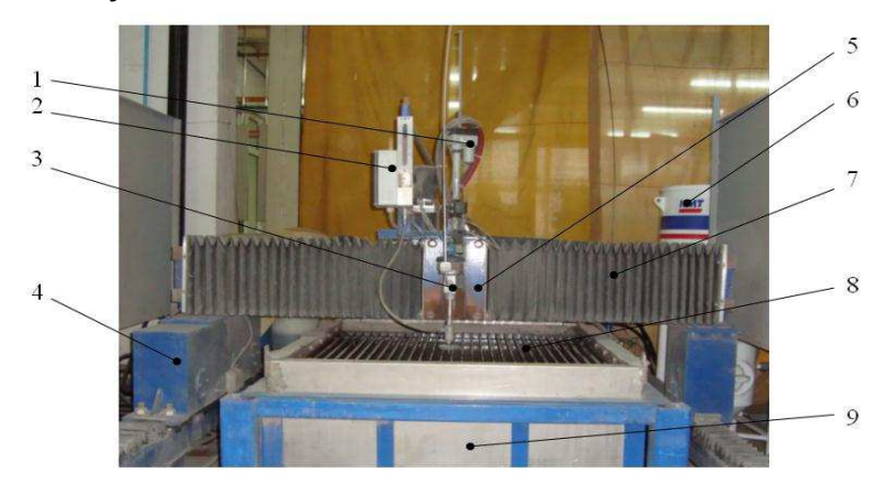
Figure 2. Water jet cutting equipment

Workstation used for cutting the samples is shown in Figure 2, and is composed of the following elements: 1 - Cutting head; 2 - Abrasive dispenser with adjustable flow rate: 50 to 600 g/min; 3 - Cutting head with water jet and abrasive; 4 - Carriage longitudinal feed; 5 - Cross stroller advance; 6 - Abrasive hopper; 7-Portal cutting (cross-beam); 8 - Grill cut; 9 – Tank with stop and dispersion of abrasive water jet.