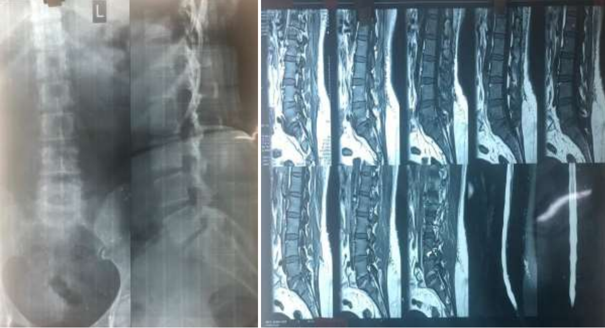
Pre-Operative X – Ray

Case No. 1: 44 Year old female with chronic leg pain and neurogenic claudication