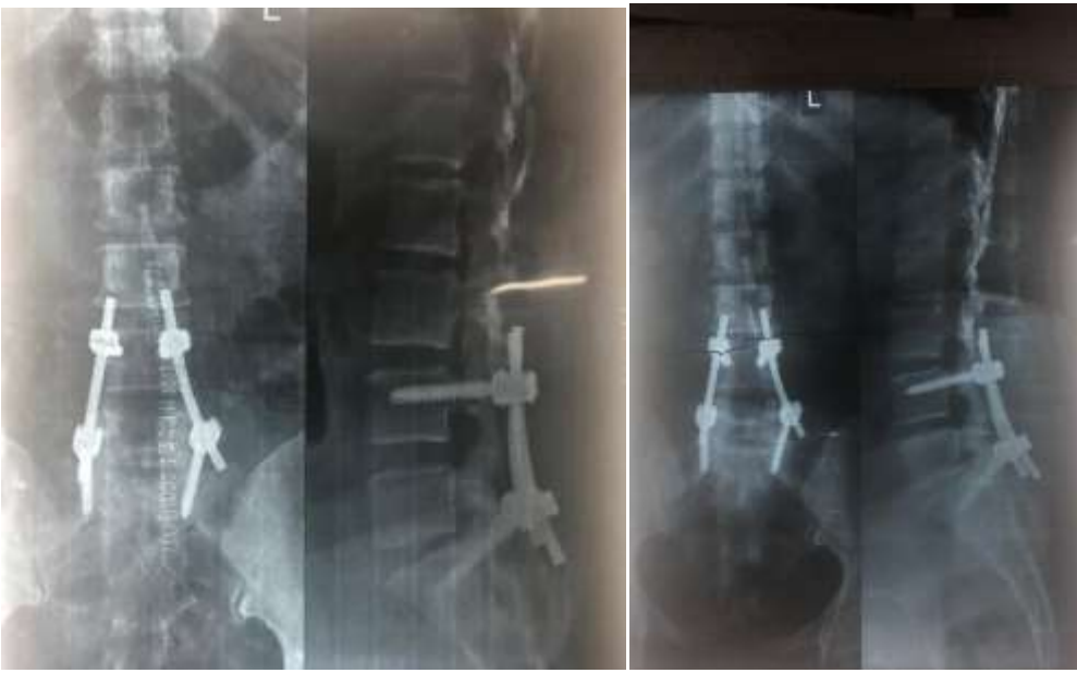
Immediate post operative X-ray