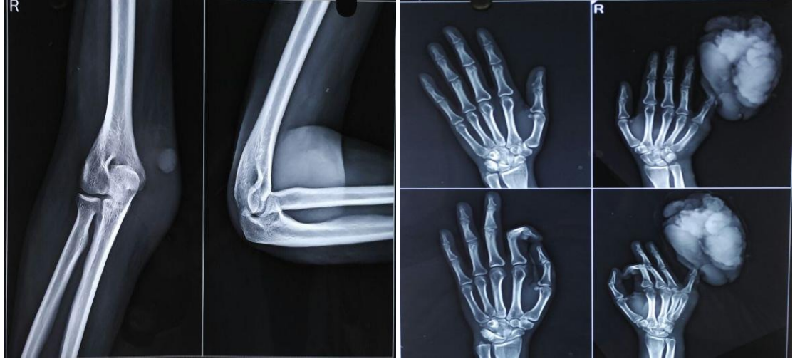
Fig. 4: Radiograph showing osseous involvement and soft tissue shadow