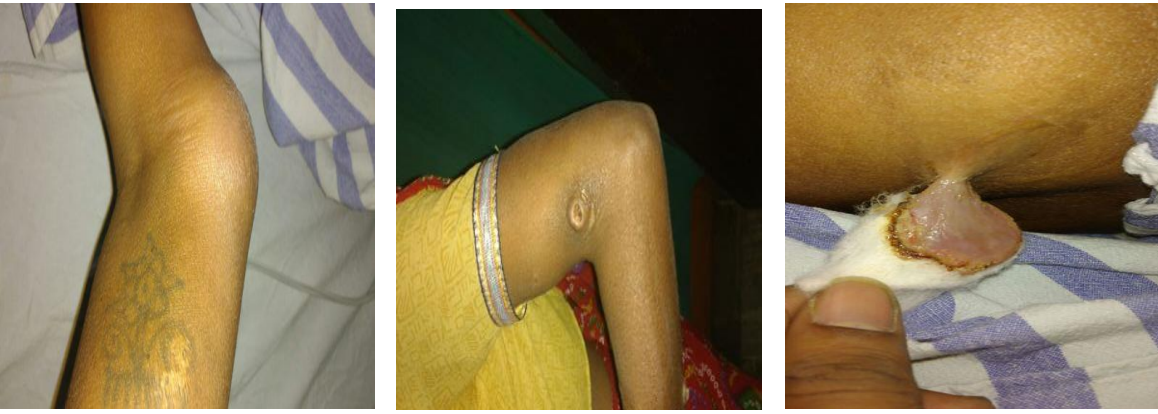
Fig. 2: Musculoskeletal swelling of forearm