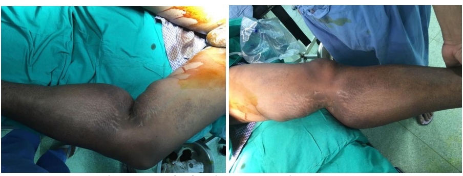
Fig. 7: Swelling over postero-medial aspect of left thigh and proximal leg