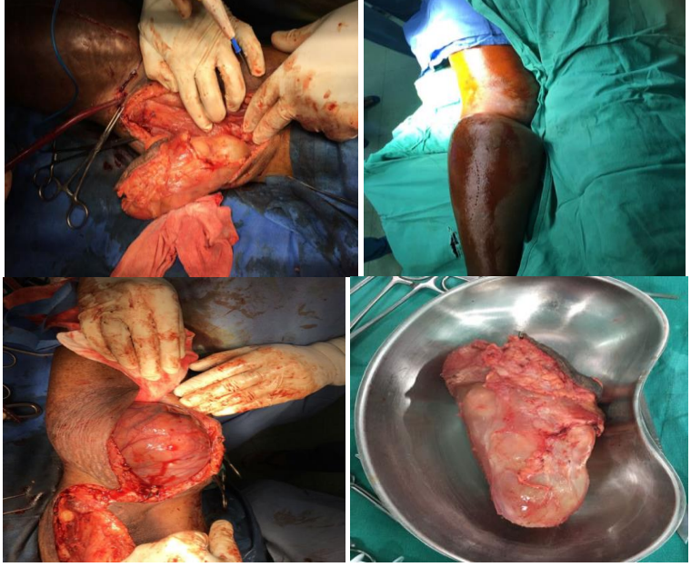
Fig. 9: Marginal excision of the mass