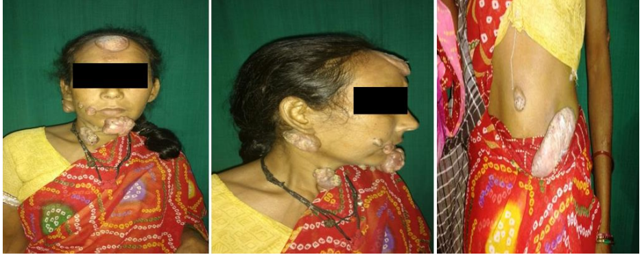
Fig. 3: Clinical picture depicting face and abdomen with multiple swelling with ulceration