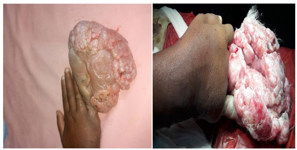
Fig. 1: Picture depicting fungating mass over little finger of right hand

This case was managed with ray amputation of right little finger from shaft of 5<sup>th</sup> metacarpal and excision of swelling from subcutaneous plane right forearm along with other cutaneous lesions. (Fig. 5, 6) Histopathology report showed sporangia of various shapes and sizes representing different stages of maturation.