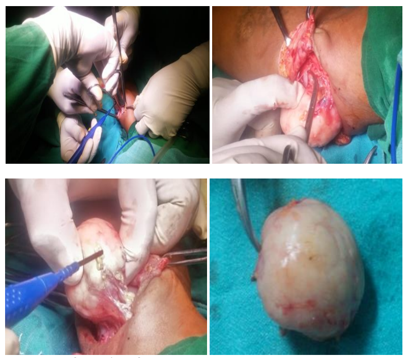
Fig. 5: Excisied cutaneous mass from right forearm