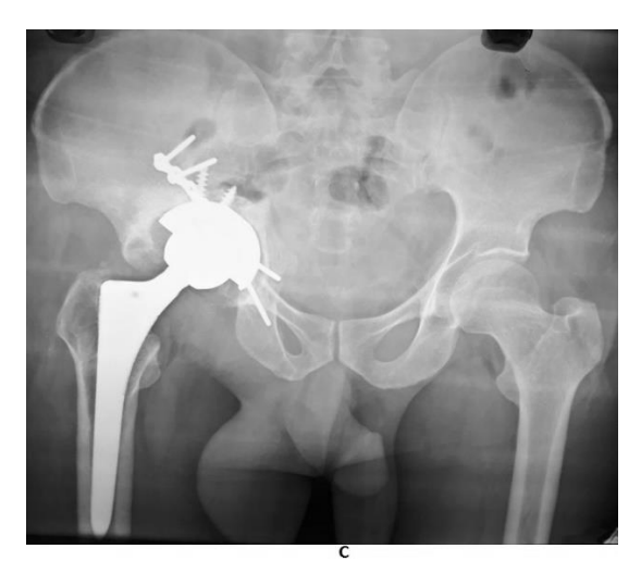
Fig. 1C: Post-operative radiograph at 2 years showing discontinuity healing and consolidation of impaction graft. Migration of cup is seen without affecting the stability.