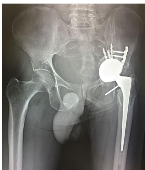
Fig. 2D: Post-operative radiograph at 1 year showing of discontinuity healing with stable cup