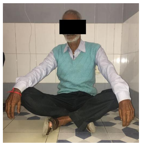
Fig. 2G: Functional status of the patient showing sitting cross-legged