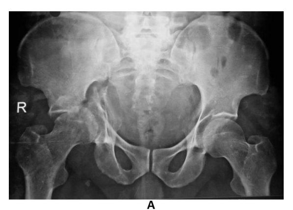
Fig. 1A: Pre-operative AP radiograph of ununited transverse with posterior wall acetabulum fracture.

Superficial surgical site infection was seen in one patient which was treated with local debridement and IV antibiotics. Heterotopic ossification (HO) was present in one hip (9.1%) where excessive periosteal stripping was done due to comminuted posterior wall fragment. However, this had no sequel on the final clinical outcome. No dislocation, neurological complications or deep venous thrombosis was noticed during the follow up.