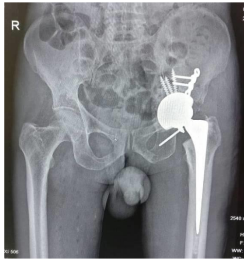
Fig. 2B: Post-operative AP radiograph at 6 months.