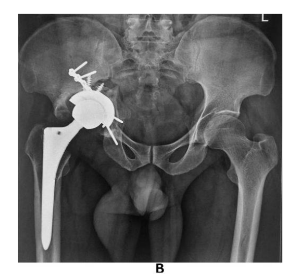
Fig. 1B: Post-operative radiograph at 6 months