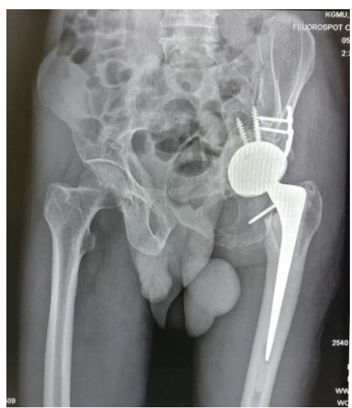
Fig. 2C: Post-operative obturator view radiograph at 6 months