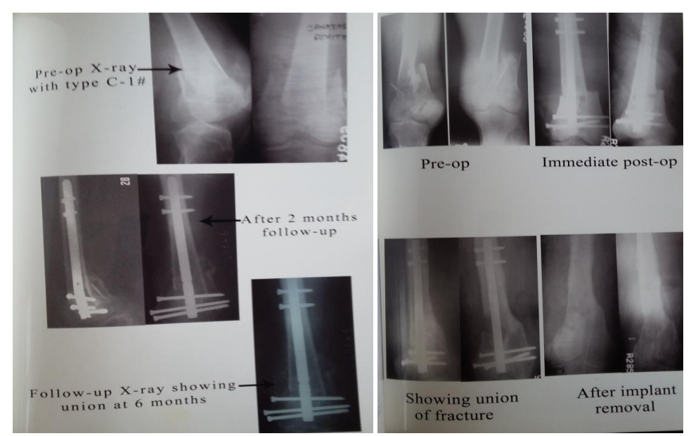
Fig. 1A: Showing Pre-operative X-ray, follow-up X-ray after 2 months and Follow-up X-ray showing union at 6 months; B: Showing Pre-operative X-ray, Immediate post operative X-ray, Union of fracture, and after removal of implant