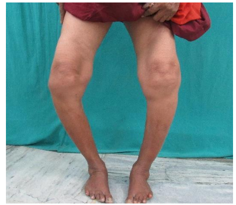
Fig. 7: Photograph of patient in standing position from the front planned for Right TKR