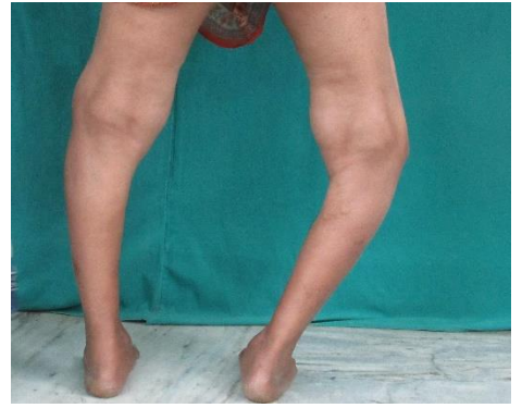
Fig. 9: Photograph of the patient standing from the back planned for Right TKR