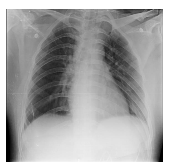
Fig. 2: Chest X-Ray of male patient taken immediately after the complaint of Breathless showing Oligaemia (PE) (decreased vascular marking) over right lower lobe of lung