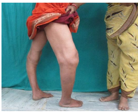
Fig. 8: Photograph of the patient in standing from the lateral side of patient planned Rt TKR