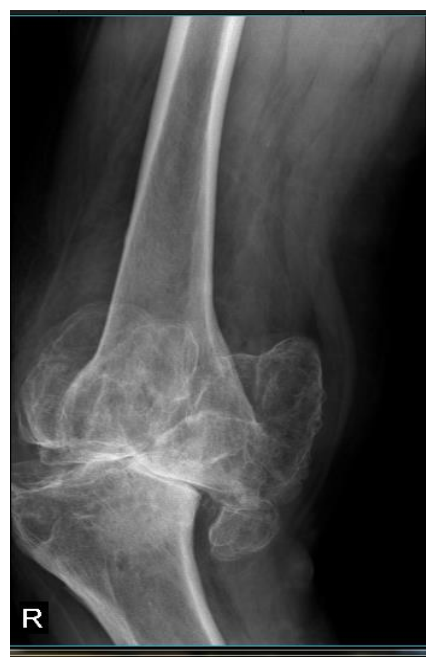
Fig. 10: X-ray of the patient AP view of Right knee