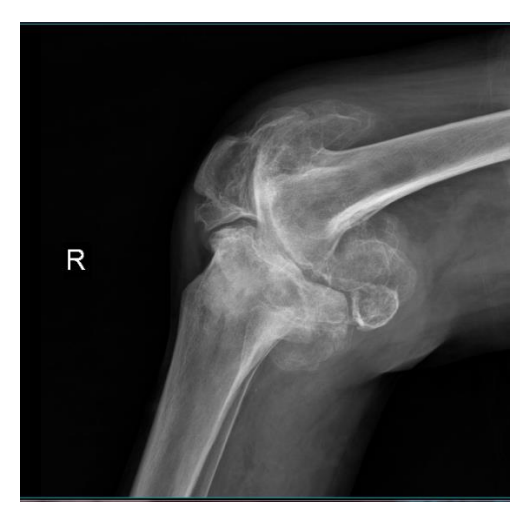
Fig. 11: X-ray of the patient lateral view Right side