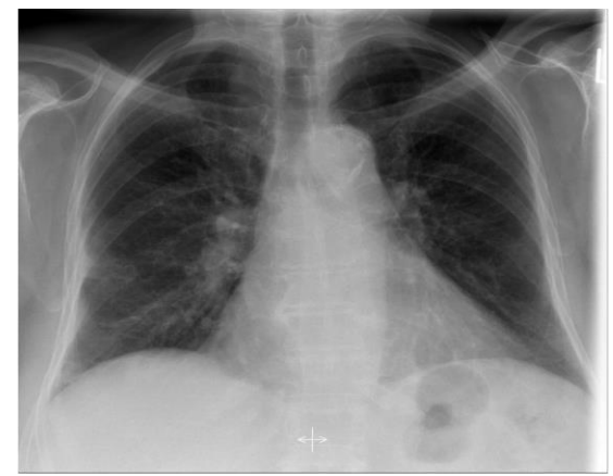
Fig. 3: Male patient which shows wedge shaped infarct area over the same zone of lung (progressed lesion)