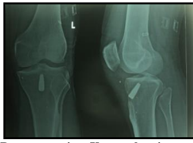
Fig. 4: Post operative X-ray showing endobutton and interference screw

Antibiotics and analgesics were given to the patient till the time of suture removal. Sutures/staples were removed after the 10th post operative day depending on wound condition. ROM knee brace was given post operatively. Patients were followed post operatively at 6,10 and 14 weeks thereafter every 3 months up to 1 year.