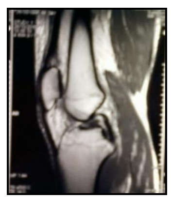
Fig. 1: MRI showing complete ACL tear

no previous surgeries to the concerned knee. Patients above 45 years and below 15 years of age, patients with comorbid conditions and medically not fit for anesthesia, patients associated with fractures around knee and other ligament injuries and patients with generalized ligamentous laxity were excluded from study. All the patients who came to orthopaedic OPD were examined to confirm laxity of knee joint and to rule out any associated injuries. All the patients were subjected for X-rays which includes X-ray knee joint with antero posterior and lateral views to rule out any tibial spine avulsion and clinical diagnosis was confirmed with MRI scan of concerned knee (Fig. 1)