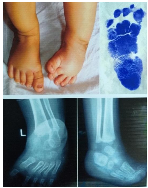
Fig. 3: Illustrated case pre-treatment