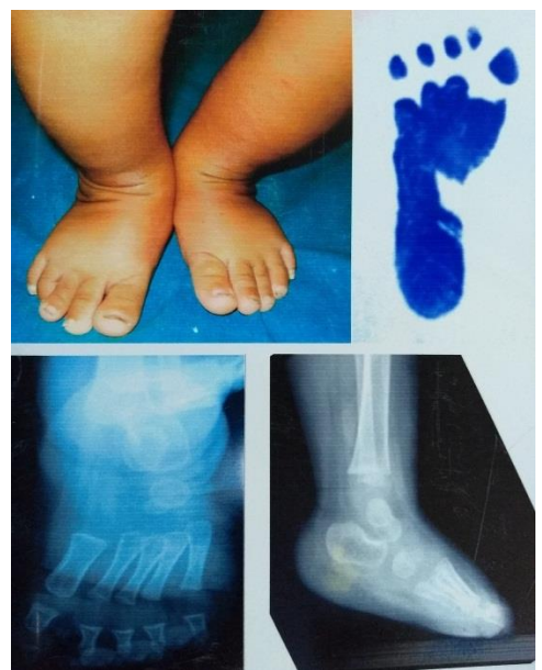
Fig. 4: Post-treatment