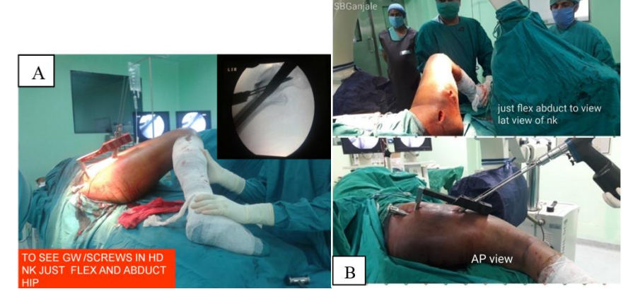
Fig. 7A, B: Clinical photo passing head neck guide wire and reaming and to show how lateral view of neck is seen

Distal interlocking of PFN is done by freehand technique by identifying interlocking holes and interlocks it under C-arm.