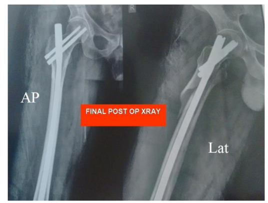
Immed post op X-ray