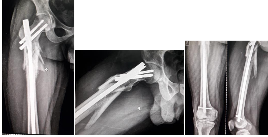
Follow up at 2 months fracture consolidation

Operative wound wash is given with normal saline and betadine and incisions are closed. Pressure bandage is applied to whole lower limb from foot to proximal thigh.