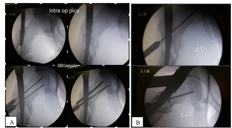
Fig. 6A: Enlarging entry with starting reamer and passing long PFN; 6B. Head neck screw holes aligned and GW passed in head and neck AP and Lat view

guide wire placement is checked in c arm. (Fig. 5)