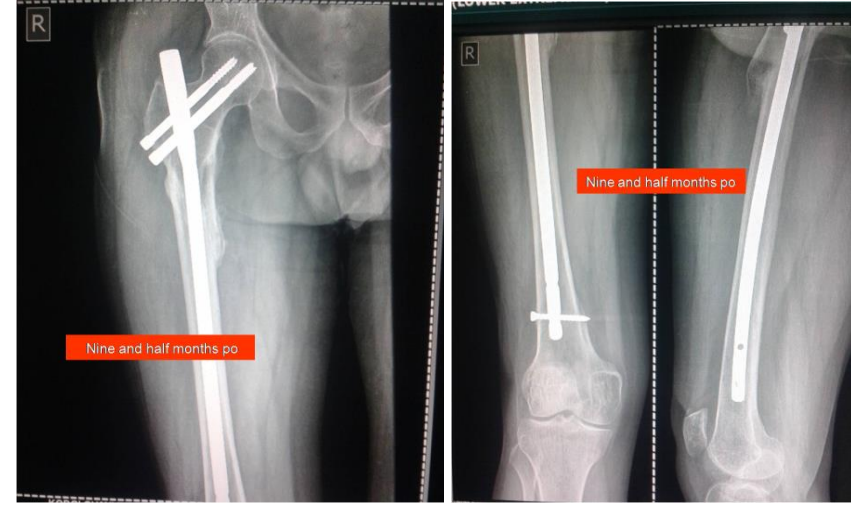
Nine months follow up full union