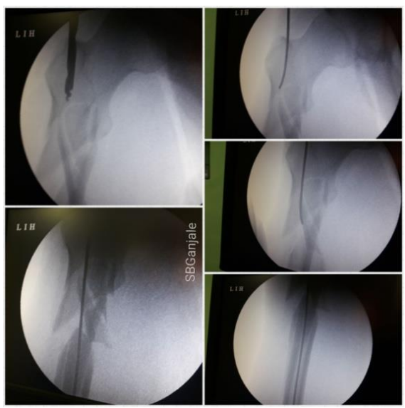
Fig. 5: Entry and passing guide wire

Incision is marked over superolateral quadrant over gluteal region the incision is about 5cms proximal to tip of greater trochanter. (Fig. 3B) Tensor fascia lata and Gluteus maximus muscle is split vertically in the line of incision to reach pyriformiss fossa. Entry in pyriformis fossa is done with smaller size 6 mm straight k-nail reamer, and later enlarged with larger diameter reamer. Now a guide wire is passed through the entry to negotiate the fracture site and distal segment. (Fig. 5)