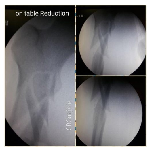
Fig 4. Screening of Fracture alignment in lateral position

Primary screening of fractured limb is done under C-arm to know the fracture geometry and check the reduction and alignments that can be achieved primarily and necessary adjustments be done accordingly. (Fig. 4)