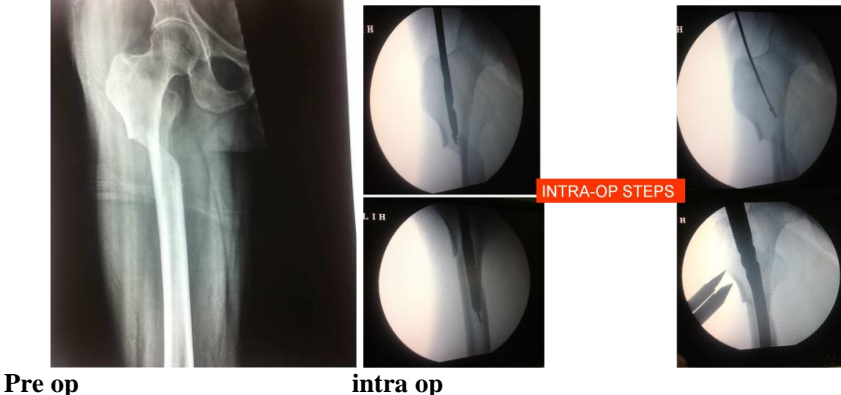
Indian Journal of Orthopaedics Surgery, July-September, 2018;4(3):273-281