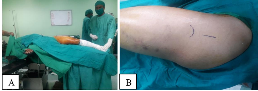
Fig. 3A, B: Full and free draping of fractured limb and incision marked

The whole fractured lower limb is scrubbed from umbilical region upto ankle level and prepped with povidine iodine. The fractured limb is freely draped so as to have free movements at hip and knee during the surgery. (Fig. 3A)