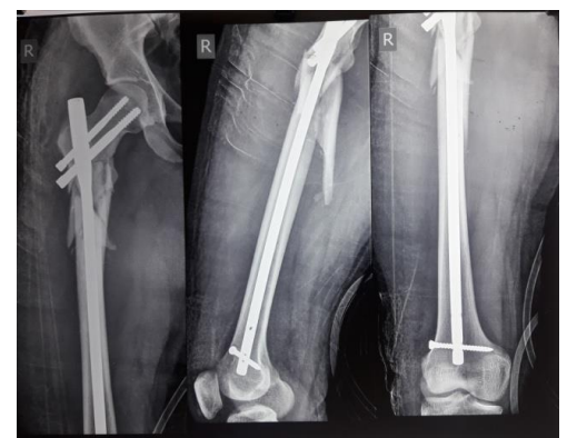
Fig. 8: Immediate post op X-ray