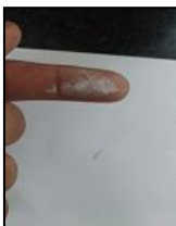
Fig 10 (Rekhapurnatva pariksha)

which was kept in the Pithara Yantra . The metal which got settled in the Pithara Yantra , was collected (Fig-3) and the whole process was repeated for two times. Every time fresh and same amount of liquid media was taken.