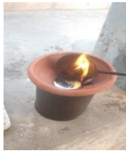
Fig 2 (Dhalana of vanga)