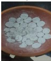
Fig 7 (Chacrika, after puta)