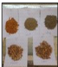
Fig 5 (Jarana dravya)