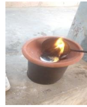
Fig 3 (Shodhita vanga)