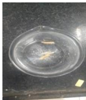
Fig 8 (Unama pariksha)