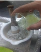
Fig 4 (Bhavna of kumari swarasa)