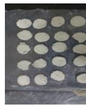
Fig 6 (Chakrika nirmana)