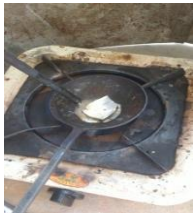
Fig 1 (melting of vanga)