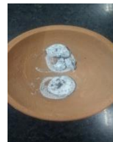
Fig 9 (Apunarbhav pariksha)