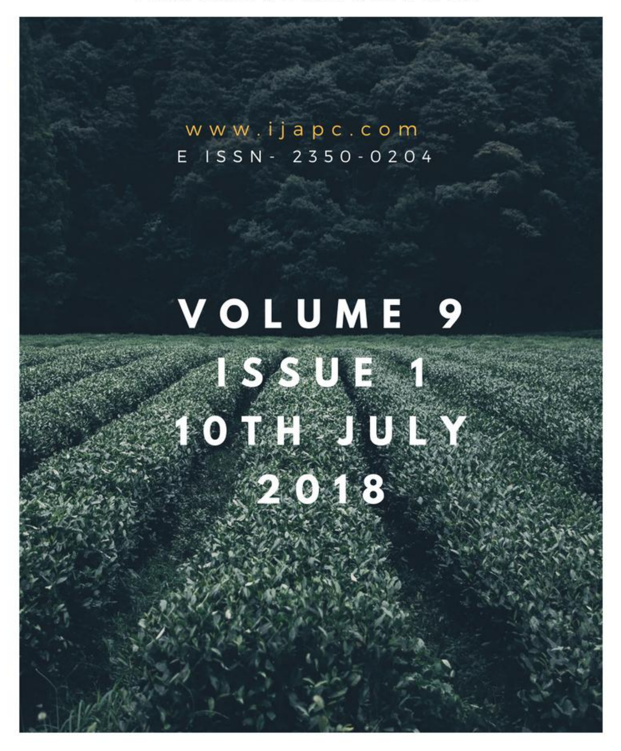
Greentree Group Publishers