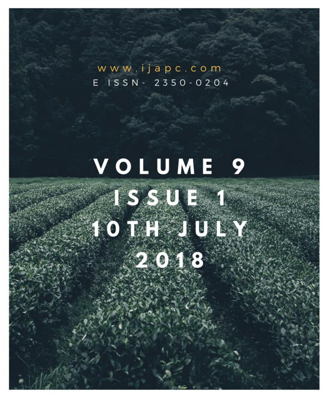
Greentree Group Publishers