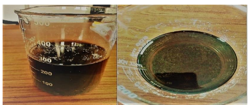
Fig. 1: Zinc-aspirin metal complex

The Pale yellow colour Zinc-aspirin compound had been synthesized having melting point of 112 - 116^{\circ} C. (Fig. 1)