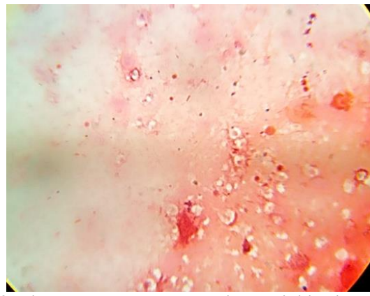
Fig. 2: Picture shows gram negative bacilli in singles and groups