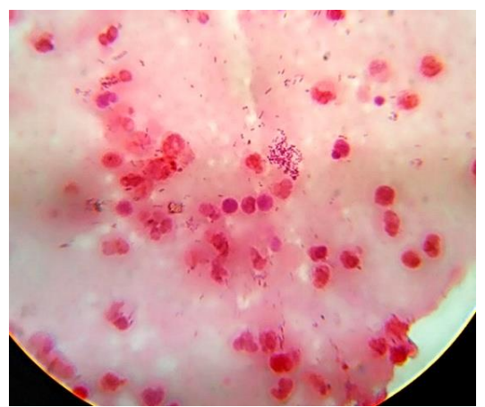
Fig. 1: Picture shows pus cells with gram positive cocci in singles, pairs and chains