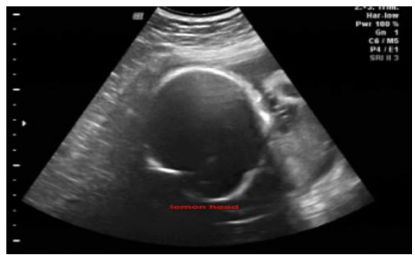
Fig. 2: Fetus in lemon shape skull