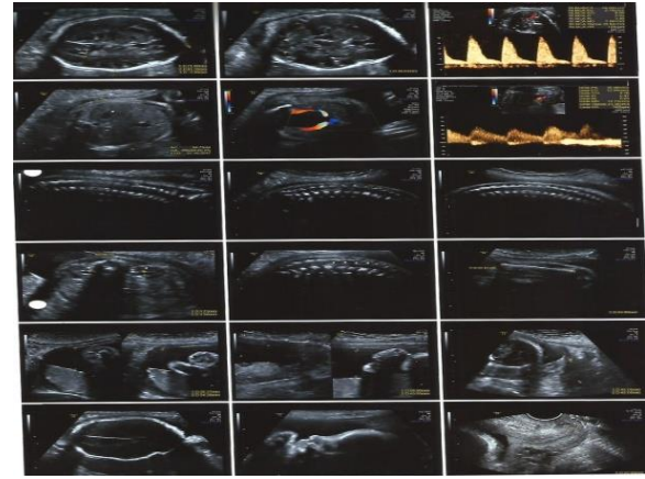
Fig. 5: Full usg analysis

Management: A 30 Years old primi gravida female came to opd for routine antenatal check up. As per usg finding she diagnosed as a lemon shaped skull and hydrocephalus (Fig. 1,2,3,4,5). usg report convey to patient and advised for further evaluation (karyo typing and genetic study) but patient refused and didn't came for further check up.