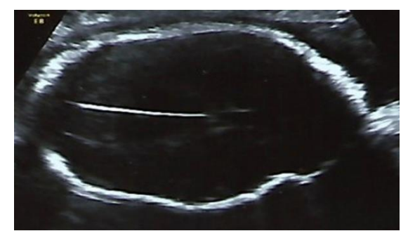
Fig. 4: Hydrocephalus in patient