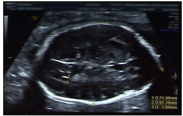
Fig. 3: Depressed ant. frontanalle fetus