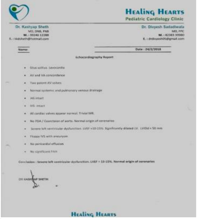
Fig. 2: Postnat echo findings