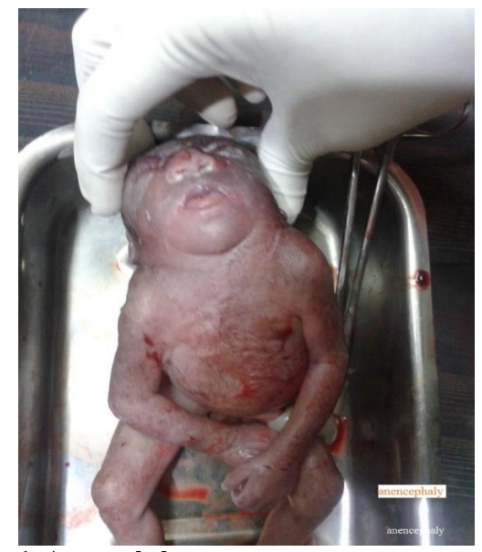
Fig. 1: Anencephaly