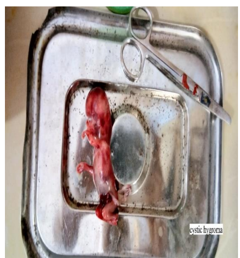
Fig. 3: Cystic hygroma