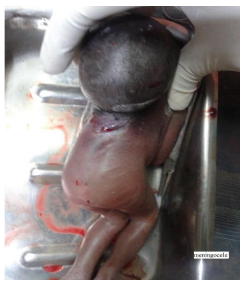
Fig. 2: Meningomyelocele