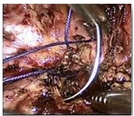
Fig. 2: Image showing adhaesions of the bladder wall,isthmocele and part of major omentum during the laparoscopic procedure; Endoscopic department, Robert Károly Private Hospital, Budapest, Hungary, 2016