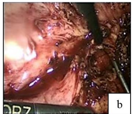
Fig. 4: Image showing bladder walls pushed up from the site of isthmocele for about 2 cm, during the laparoscopic procedure; Endoscopic department, Robert Károly Private Hospital, Budapest, Hungary, 2016