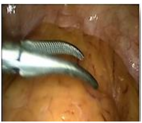
Fig. 3: Image showing the peritoneal and retrovaginal septum involvement of endometriotic leasions during the laparoscopic procedure; Endoscopic department, Robert Károly Private Hospital, Budapest, Hungary, 2016