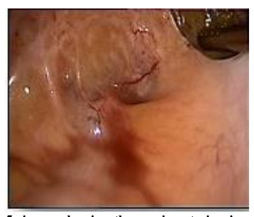
Fig. 5: image showing the cervico-uterine junction where scar tissued has been excised, during the laparoscopic procedure; Endoscopic department, Robert Károly Private Hospital, Budapest, Hungary, 2016