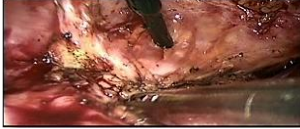
Fig. 6: Image showing the closure of the trimmed uterine wall, with a 2.0 absorbable suture, during the laparoscopic procedure; Endoscopic department, Robert Károly Private Hospital, Budapest, Hungary, 2016