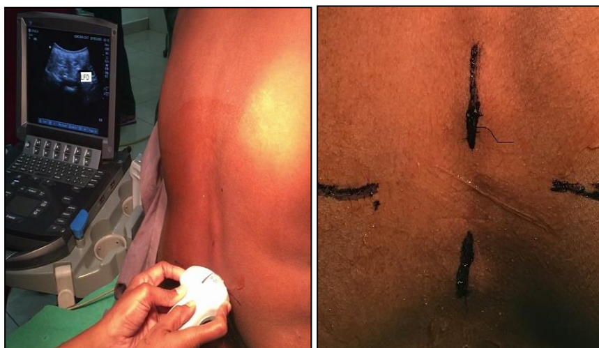
Fig. 1: A, Skin markings with the probe positioned to get the best possible transverse view of neuraxis. B, Midpoint of the long and short border of the probe marked in transverse median (TM) view. LFD = ligament flavum dura complex

The sample size was calculated using Open epi version 3, based on the study done by Karthikeyan Kallidaikurichi 13 for the primary outcome, number of attempts. The average number of attempts in group U ( 1.28 \pm 0.7 ) was approximately 0.25 times that of group L (mean \pm standard deviation) ( 1.98 \pm 1.66 ). It was found that a total of 52 patients in each group will be needed to achieve a power of 90% and type 1 error of <0.05 . We included 60 participants in each group to compensate for dropouts. Statistical analysis was done using SPSS software version 16 (SPSS Inc., Chicago, Illinois, USA). All data were analyzed for normal distribution using the Shapiro–Wilk test. Categorical data were analyzed using the Chi-square test or Fisher exact test as appropriate. Normally distributed parametric data were analyzed using Student t-test. All tests were two-tailed. P < 0.05 was considered statistically significant.